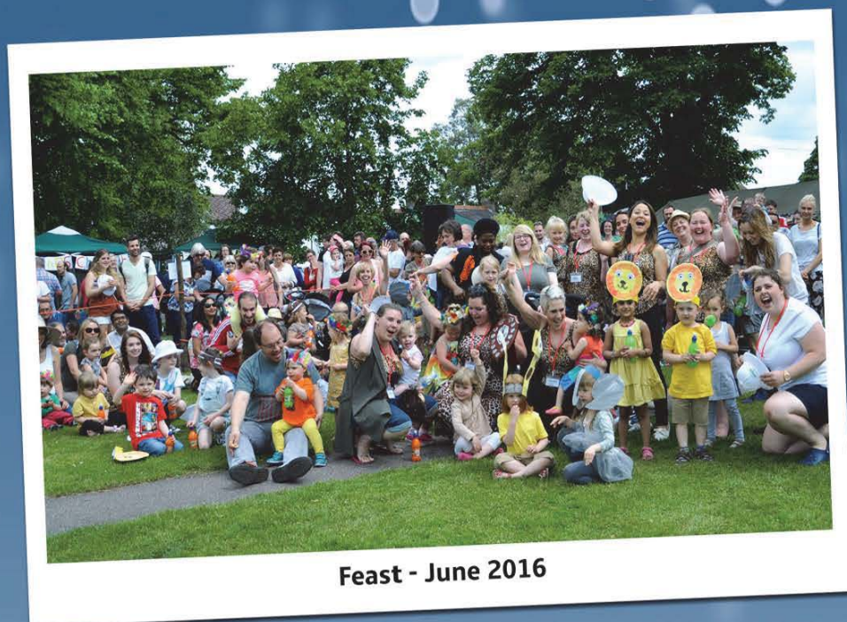
Feast - June 2016