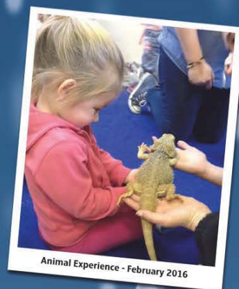
Animal Experience - February 2016