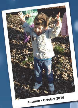
Autumn - October 2016