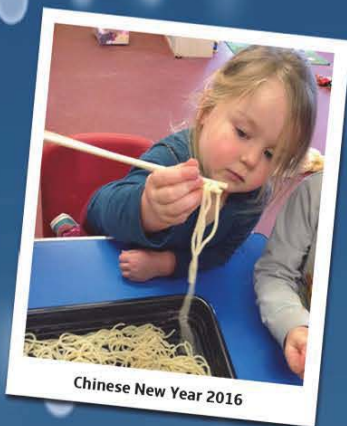
Chinese New Year 2016