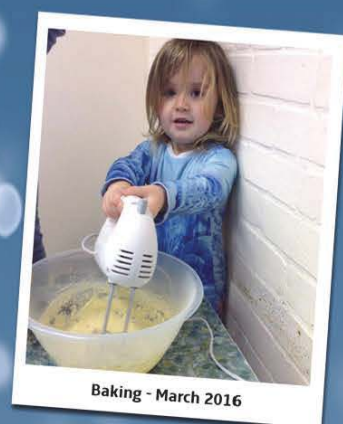
Baking - March 2016