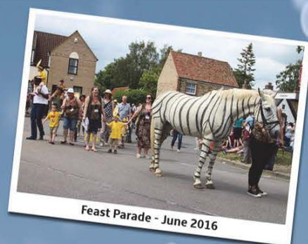
Feast Parade - June 2016