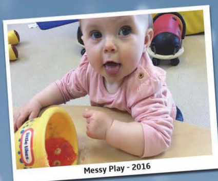
Messy Play - 2016